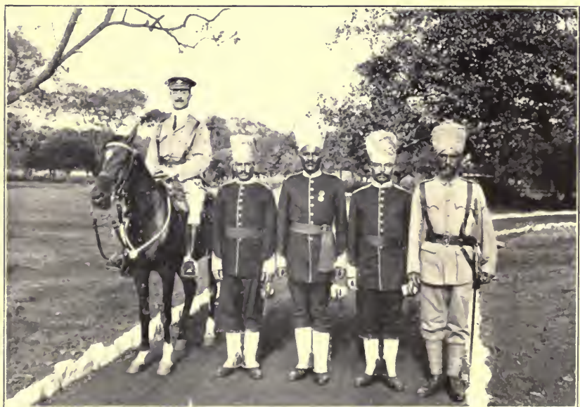
BRITISH AND INDIAN OFFICERS.